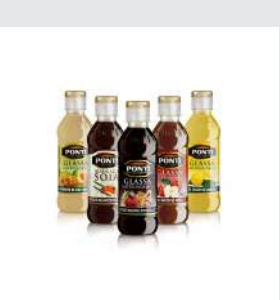
GLAZES AND TOPPINGS