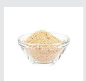
PECTINS AND STARCHES